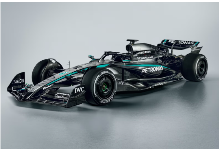
The 2025 season Mercedes Formula one car