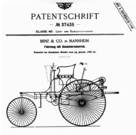
The birth certificate of the automobile: patent certificate for the 1886 motor car from Carl Benz.