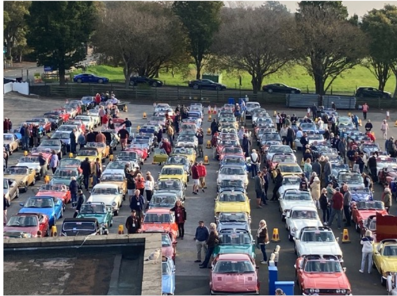
Some of the 328 cars lining up for the TT Course Parade