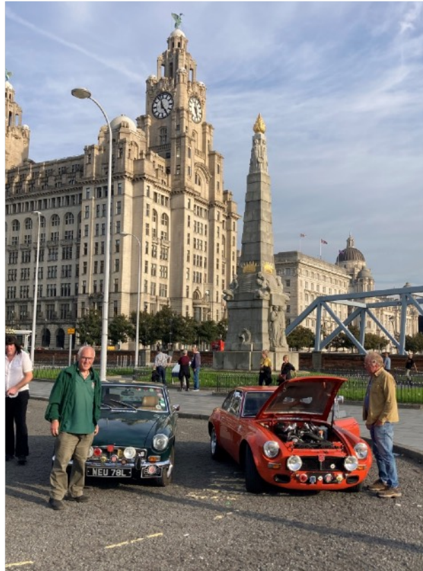
Cooling off in front of the Liver Building