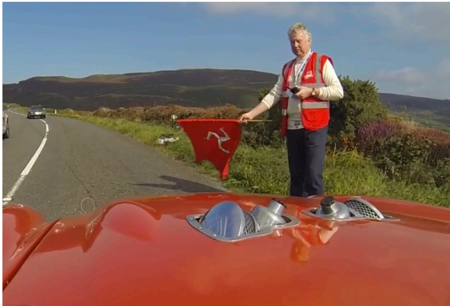
Waiting to be Flagged off for the SLOC Mountain on Closed Roads