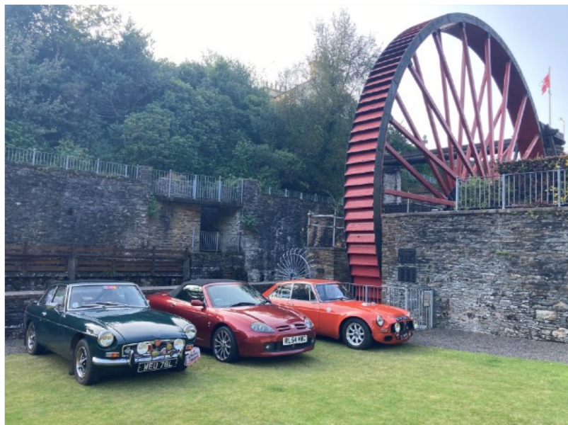
The Washing Field Laxey