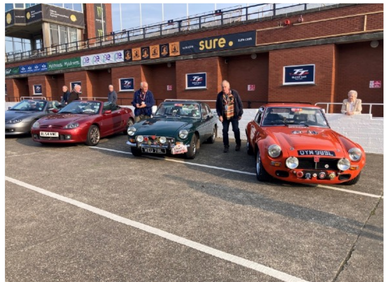
In Front of the TT Grandstand after Completing the TT Course