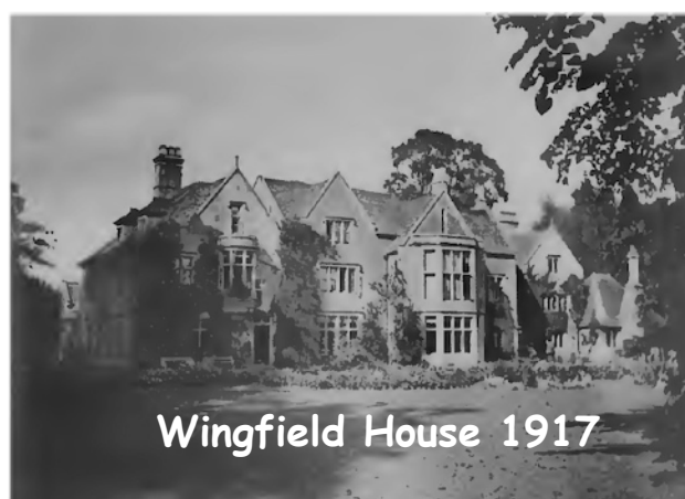
Wingfield House 1917