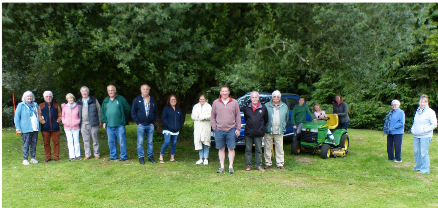
PHOTO GALLERY - AUTO TESTS IN TOM'S FIELD