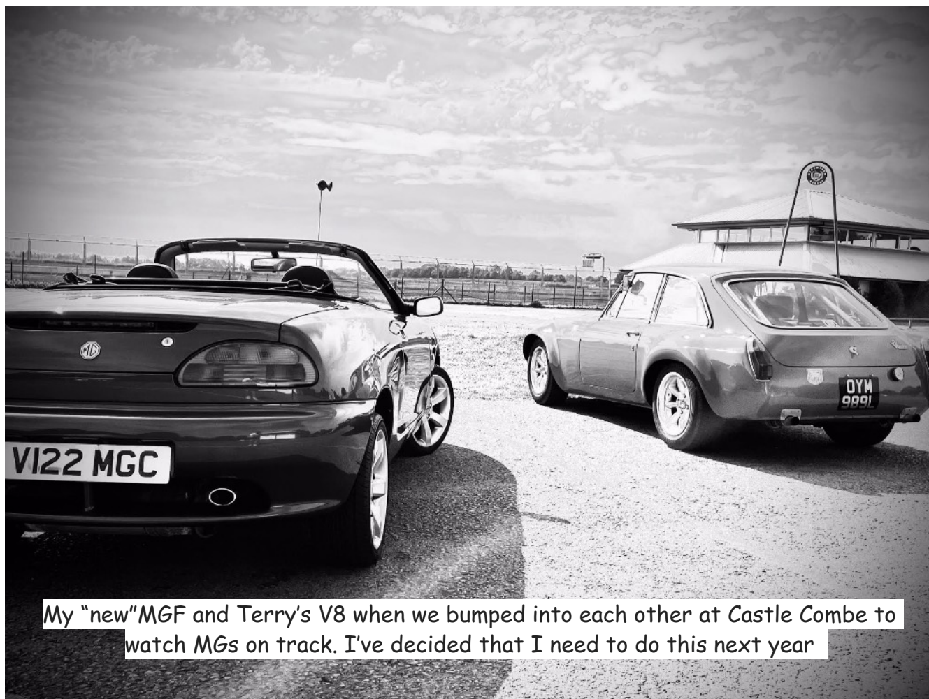
My "new"MGF and Terry's V8 when we bumped into each other at Castle Combe to watch MGs on track. I've decided that I need to do this next year