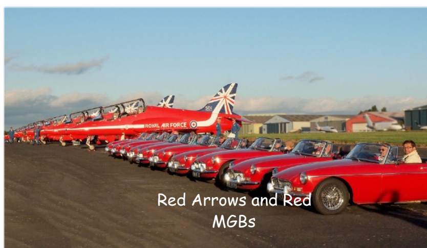
Red Arrows and Red MGBs