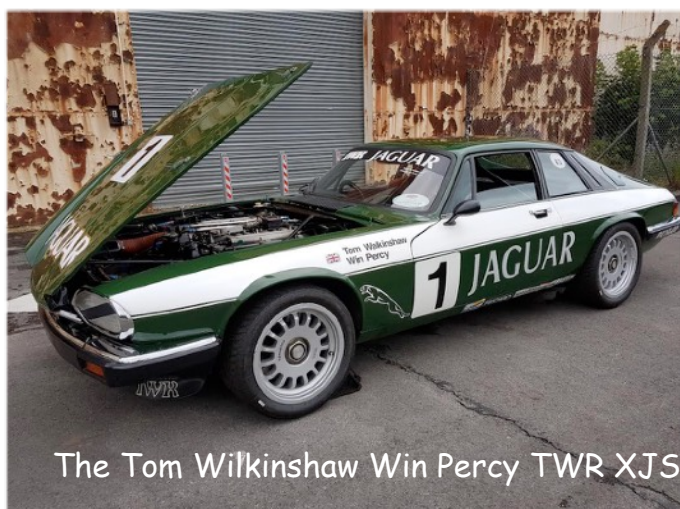
The Tom Wilkinshaw Win Percy TWR XJS