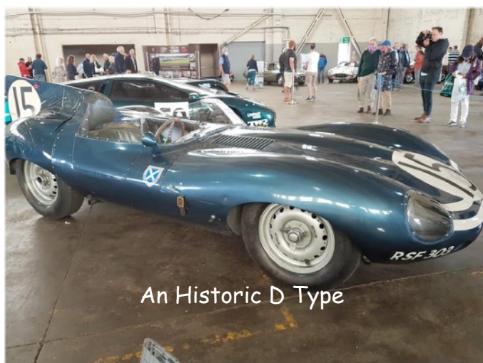
An Historic D Type