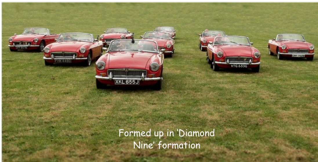
Formed up in 'Diamond Nine' formation