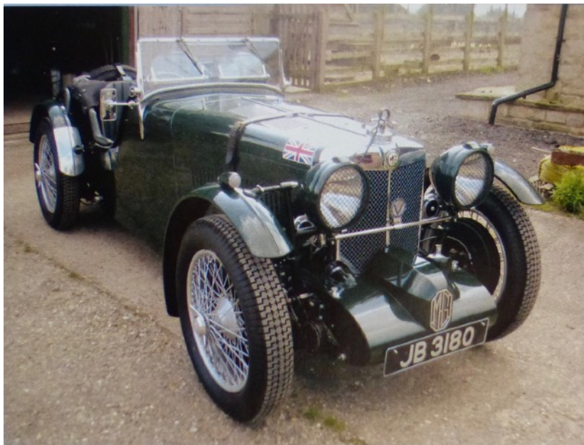
1934 MG K3 1934 'JB 3180'