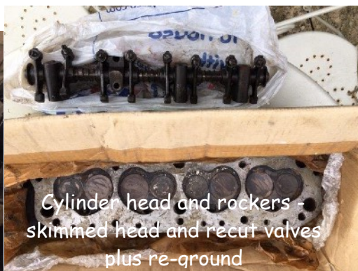
Cylinder head and rockers - skimmed head and recut valves plus re-ground