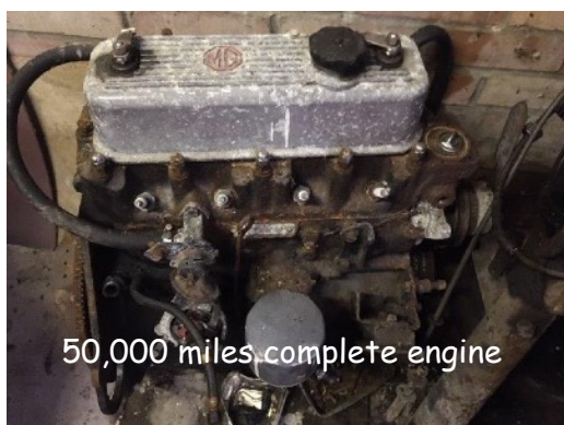
50,000 miles complete engine

short engine - belonged to the cylinder head but needs reconditioning