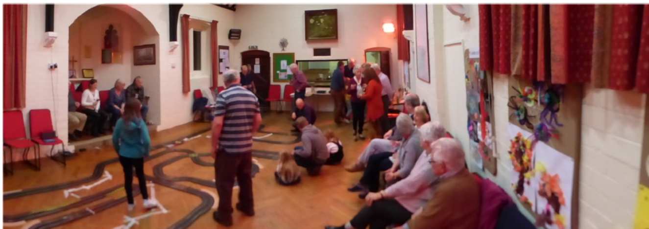
Photo Gallery - Club Scalextric Evening