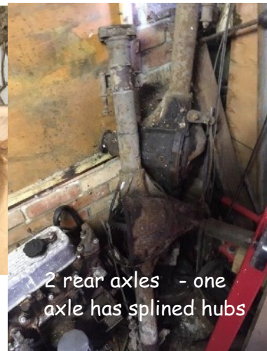
2 rear axles - one axle has splined hubs