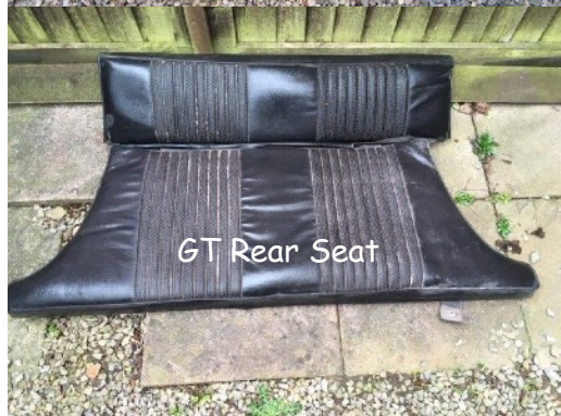
GT Rear Seat