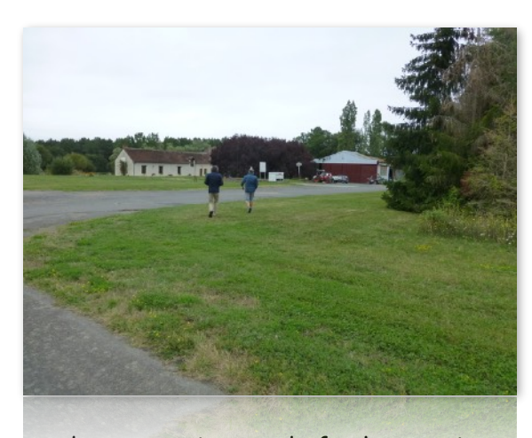
seeds are setting ready for harvesting.

As we all know each other quite well, it didn't take us long to fall into a routine. Roger had a few things that needed doing around the house which I will come back to. Times change even in