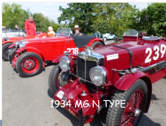
1934 MG N TYPE

MGs seen at the Prescott Vintage Speed Hill Climb 4/5 August