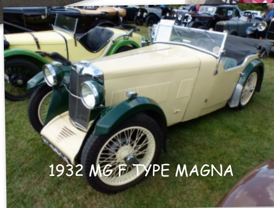
1932 MG F TYPE MAGNA