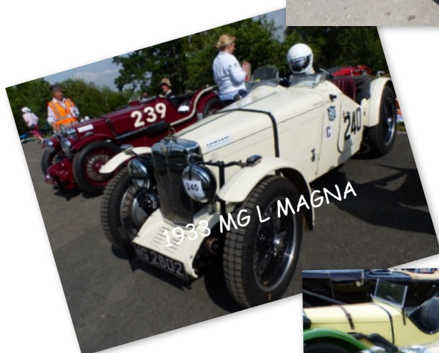
1933 MG L MAGNA