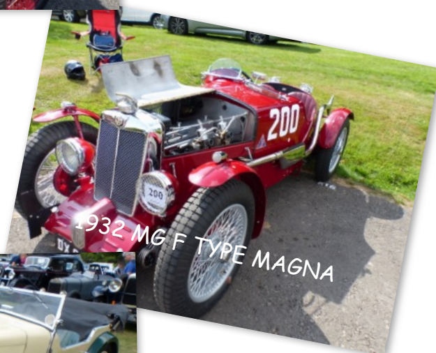
1932 MG F TYPE MAGNA