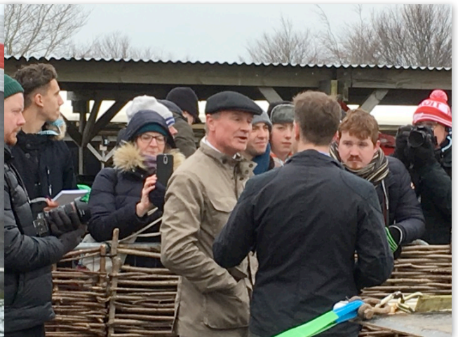
Celebrity drivers included David Coulthard driving a Gullwing Mercedes very carefully in the sub-zero temperatures.