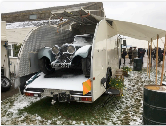
Equally as immaculate was this converted Dennis Fire Engine, transporting a stunning but snow-covered Jaguar