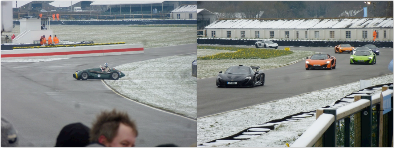
Just a few pics of drivers handling the difficult conditions in almost priceless vehicles.