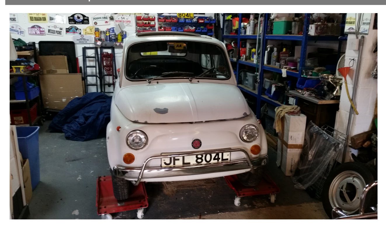
It's a FIAT 500L of course with a round Octagon badge Vic

A similar 1971 Fiat 500L was sold at the recent NEC auctions - see page 7. It was supplied with its original handbook and a spare set of keys. In apparent great condition and having covered less than 15,000 miles, it sold for £20,813. Before Vic gets too excited, one of its previous owners was our previous Prime Minister David Cameron and his First Lady. ED