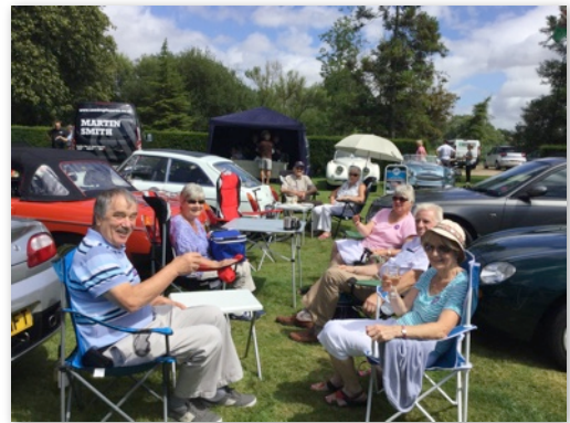
The Athelhampton MG Garden Party