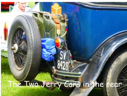
The Two Jerry Cars in the rear