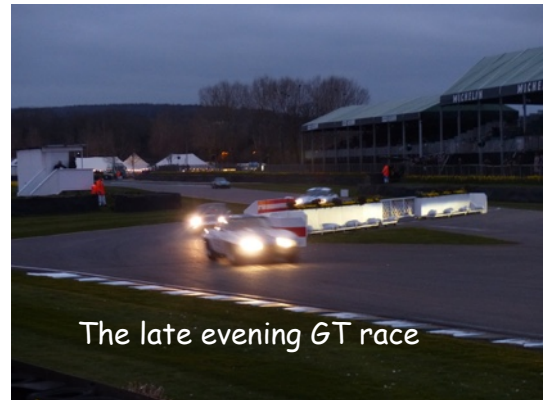
The late evening GT race

I realize I've become an old fuddy-duddy. I am a bit of a techy and enjoy the advantages that technology brings to our every day lives, including having my Morgan engine remapped. However, when it comes to motorsport, I prefer the pre-chip days of honest to goodness simple racing car design which the meeting has