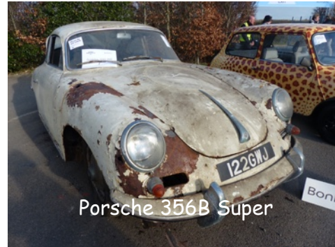
Porsche 356B Super