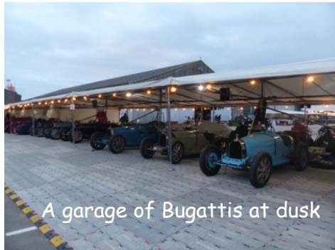
A garage of Bugattis at dusk

Last year I reported on the revival of the Goodwood Members' Meetings which was a regular event on the Goodwood calendar in period. The last of which - number 71 - was in 1966 the year the circuit closed. The background to this new event is that as a club, GRRC members put it to Lord March that the Revival meeting in September had become too busy as more people were using the event as a themed party. Although as an historic racing event it has evolved into one of the best in the world.