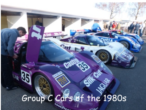
Group C Cars of the 1980s