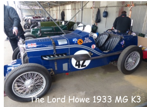
The Lord Howe 1933 MG K3

well represented and major players in period, particularly MG. In the Earl Howe Trophy for formula libre cars of the type raced before 1935 there were many Bugattis and a 1933 MG K3 which Earl Howe himself raced. Two MG Magnette ZBs took part in the Sopwith Cup a race for saloon cars that raced during the 1950s.