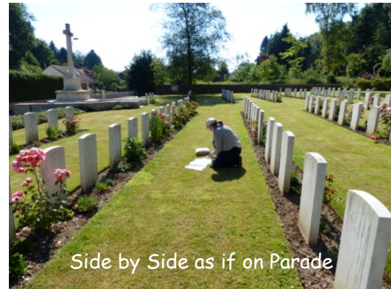
Side by Side as if on Parade

My research suggests that they were shelled or machine-gunned, probably during a trench change-over in the dark. A main ploy of the German Artillery was to blast the changeover, when they had dense targets to hit and not many places for our men to hide as the trench would have been packed with men travelling in opposite directions. Arthur's 'resting place' is beautiful, and once again, we were moved by the sights of these young men's grave stones standing side by side, as if on parade. Prayers said we left our own tokens of remembrance, as we had the day before and travelled in search of Great Uncle Ernest, Arthur's brother.