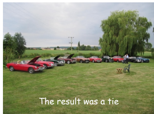
The result was a tie

As darkness fell, an impromptu working party demolished the Posh Gazebo, returned the games arena to garden and cleared up all the rubbish.