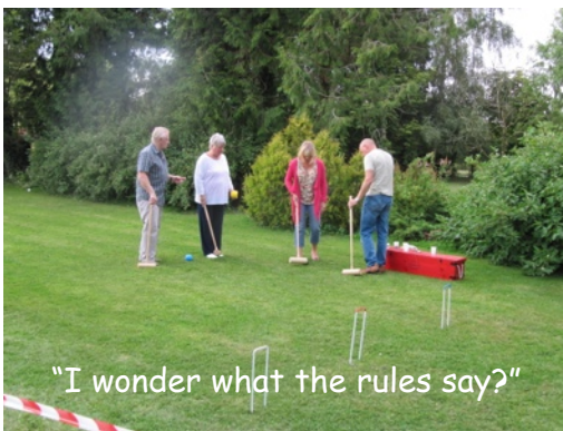
"I wonder what the rules say?"