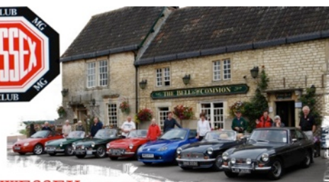
The WESSEX MG CLUB At the Bell on the Common Broughton Gifford